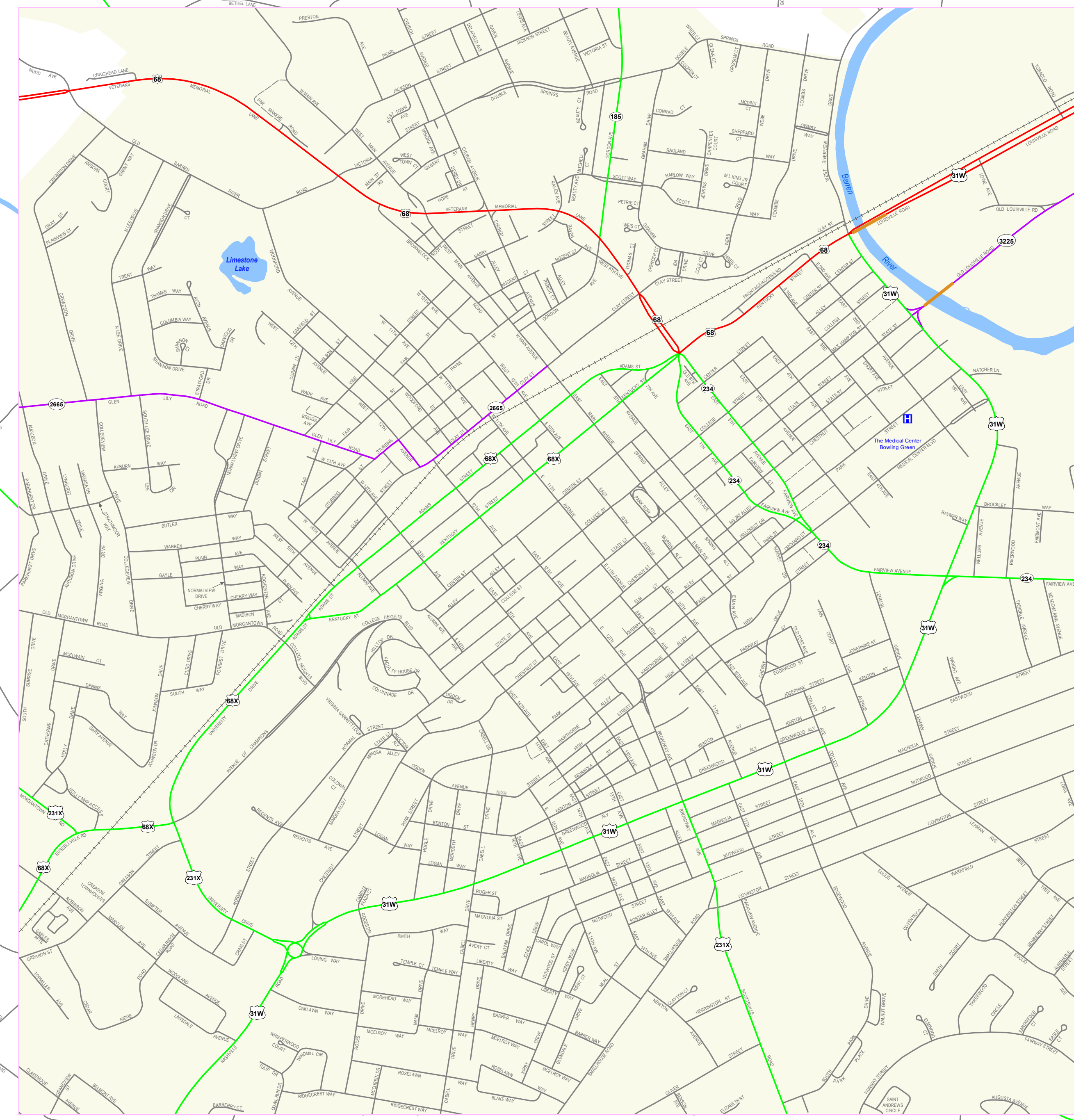
DOWNTOWN BOWLING GREEN